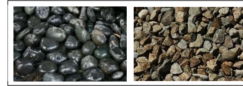
Roppouseki (Hexagon sectioned columnar stone)